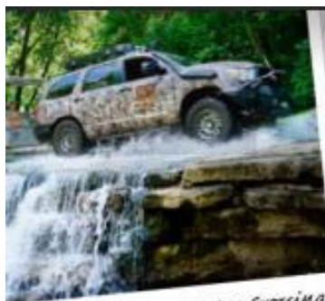
Dogwood Canyon Water Crossing