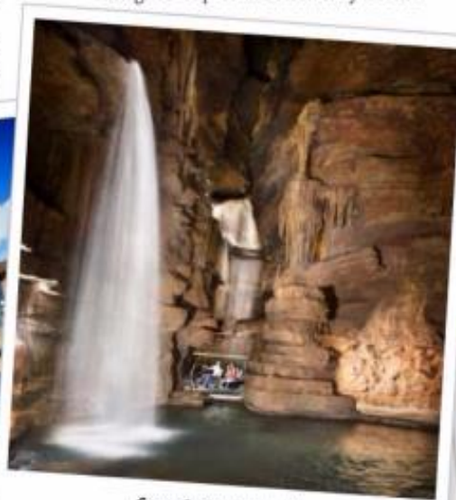
Cave Interior Falls