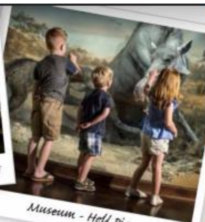
Museum - Hell Pig