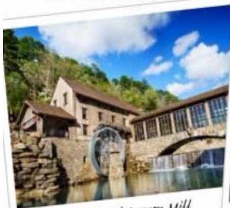
Dogwood Canyon Mill