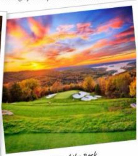
Top of the Rock