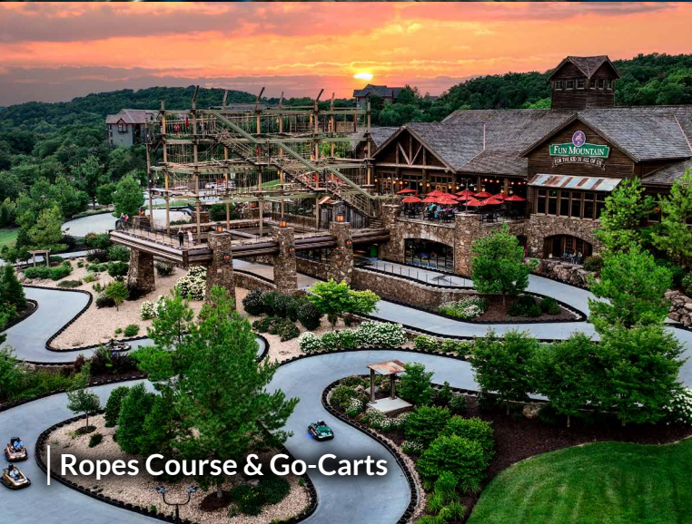
Ropes Course & Go-Carts