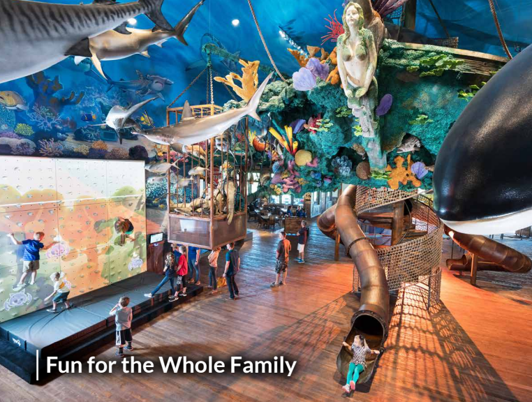
Fun for the Whole Family