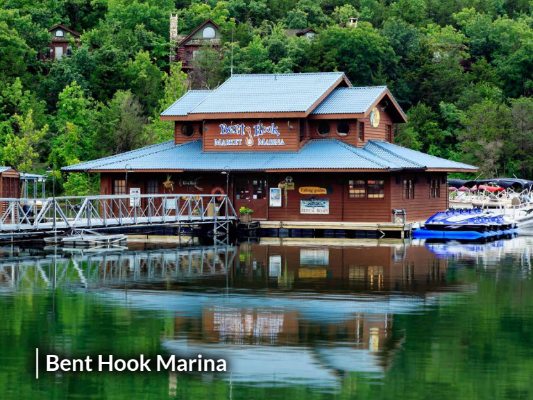
Bent Hook Marina