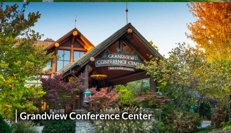
Grandview Conference Center