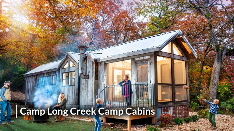
Camp Long Creek Camp Cabins