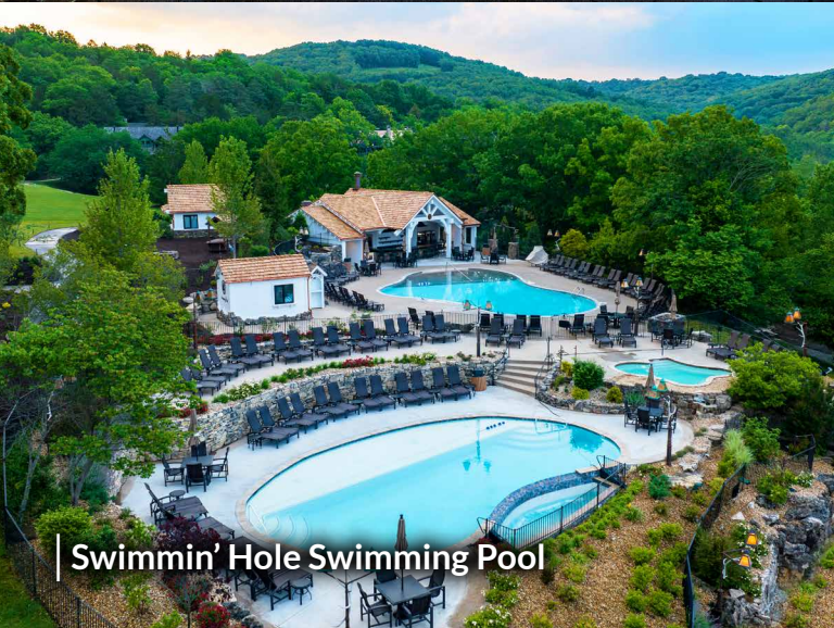
Swimmin' Hole Swimming Pool