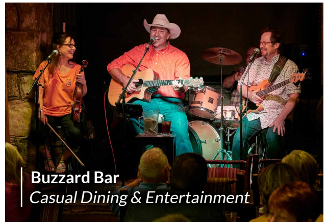
Buzzard Bar Casual Dining & Entertainment

At Big Cedar Lodge, food is one of our passions! From homestyle fare at Devil's Pool Restaurant, to traditional comfort foods and nightly entertainment at Buzzard Bar, Big Cedar dining has something for everyone to enjoy. Grab pizza or burgers at Uncle Buck's Grill after bowling at Fun Mountain. Have breakfast or lunch and a sweet treat, delicious baked good or specialty coffee at Truman Café and Custard. Or sneak in a hand-crafted cocktail and shareable plate at Harry's Cocktail Lounge & Bar tucked away in the lower level of The Worman House. After a round of golf, stop by Mountain Top Grill or hit The Canteen at Long Creek before heading out on the lake. Feel like staying in? Our Room Service team is ready to deliver when your family is hungry.