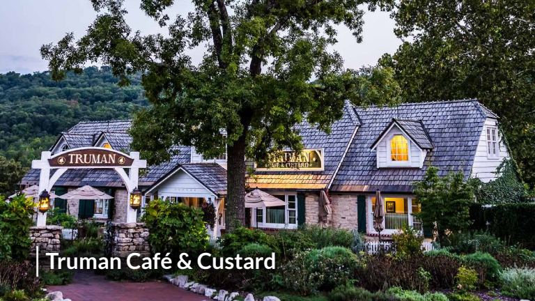
Truman Café & Custard