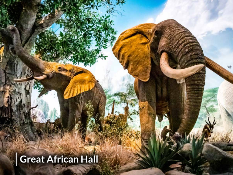
| Great African Hall