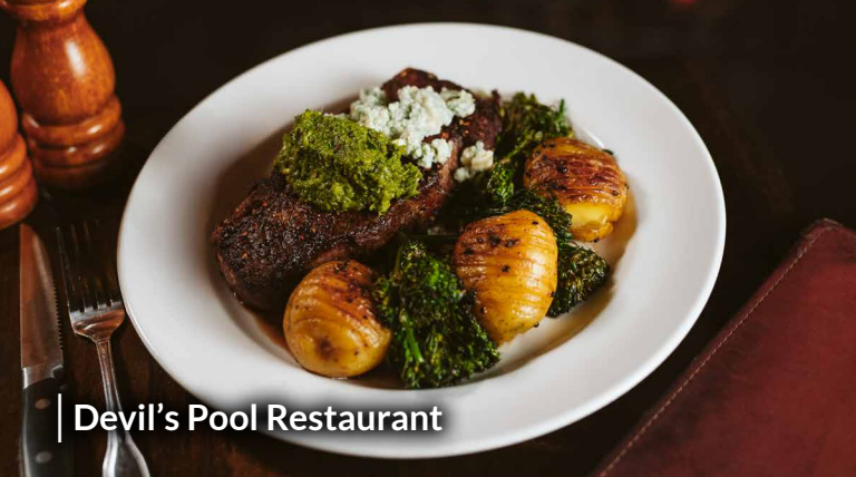
Devil's Pool Restaurant