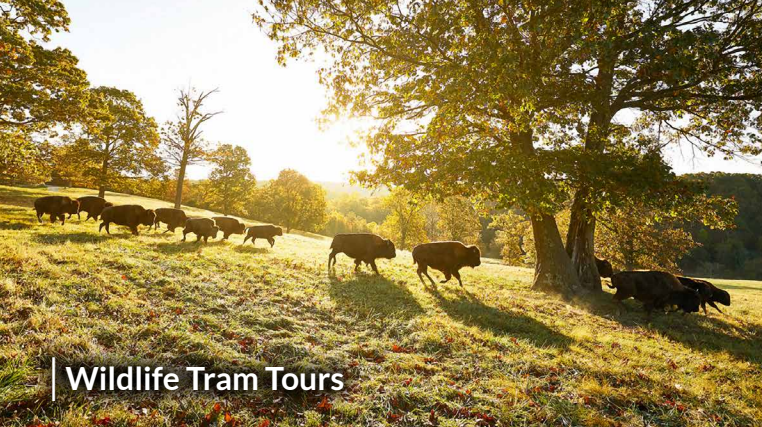
Wildlife Tram Tours