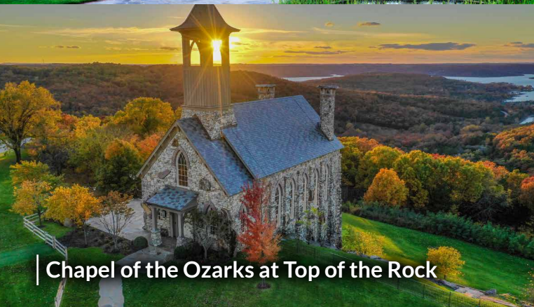
Chapel of the Ozarks at Top of the Rock