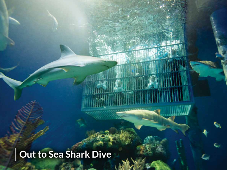
| Out to Sea Shark Dive