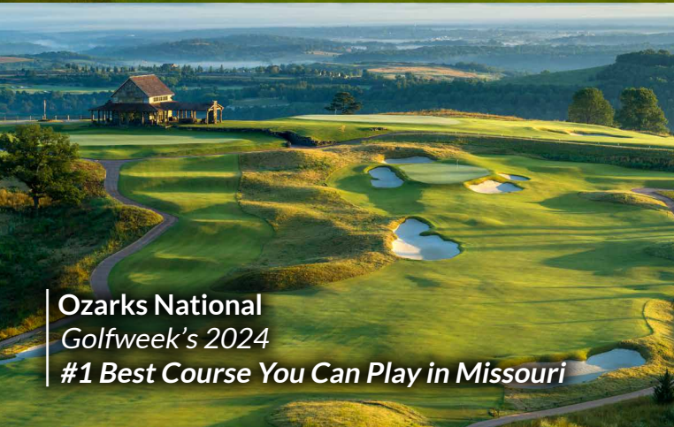
Ozarks National Golfweek's 2024 #1 Best Course You Can Play in Missouri

Paying tribute to Ozarks native and World Golf Hall of Fame member, Payne Stewart, Payne's Valley is the first public-access golf course designed by 82-time PGA TOUR winner Tiger Woods and Woods-led golf course design firm, TGR Design. Payne's Valley stands out with its inviting layout, pristine water features, large fairways and greens, and spectacular 19th hole... the Big Rock at Payne's Valley™ by Johnny Morris.