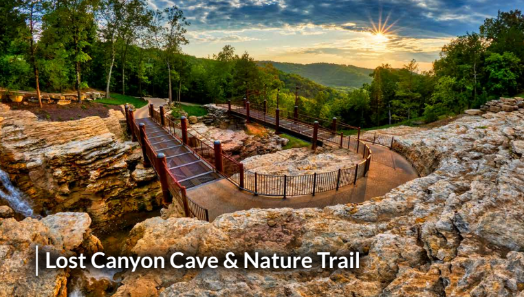
Lost Canyon Cave & Nature Trail