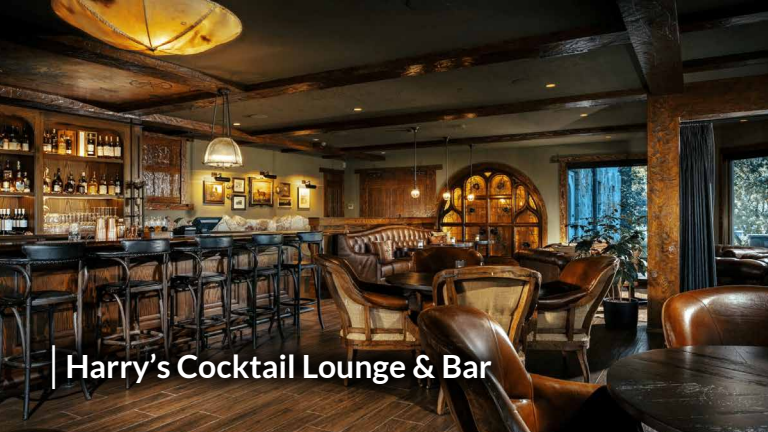
Harry's Cocktail Lounge & Bar