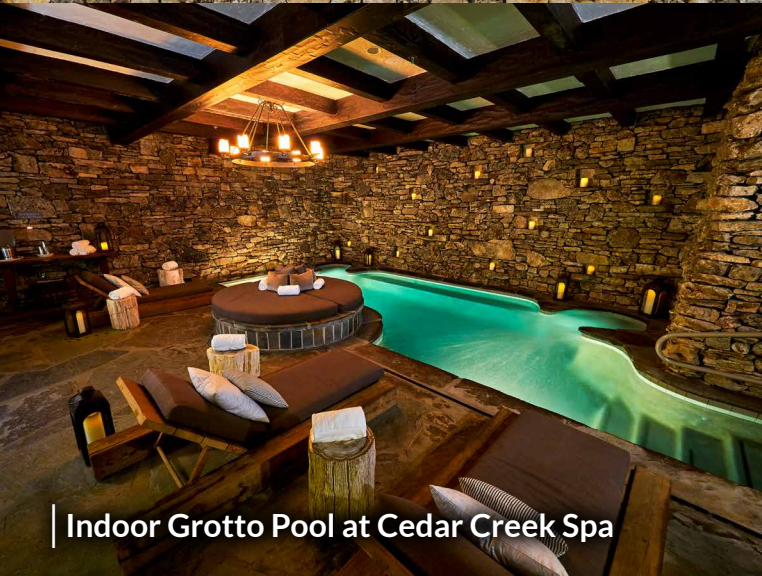
Indoor Grotto Pool at Cedar Creek Spa