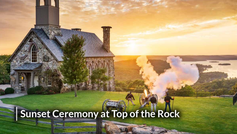
Sunset Ceremony at Top of the Rock