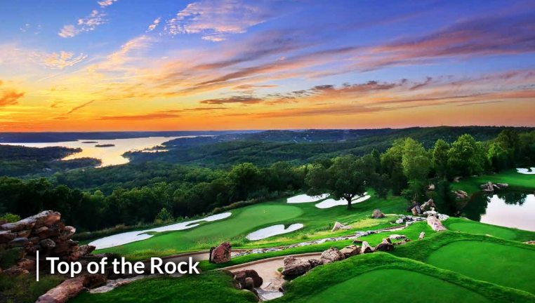
Top of the Rock