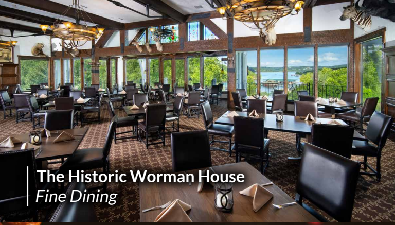
The Historic Worman House Fine Dining