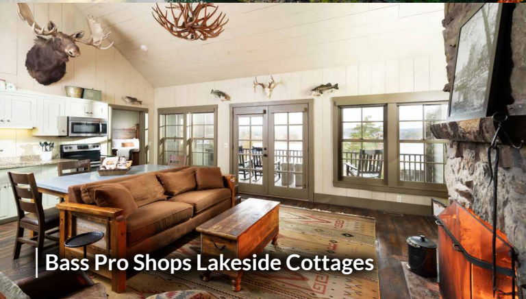
Bass Pro Shops Lakeside Cottages