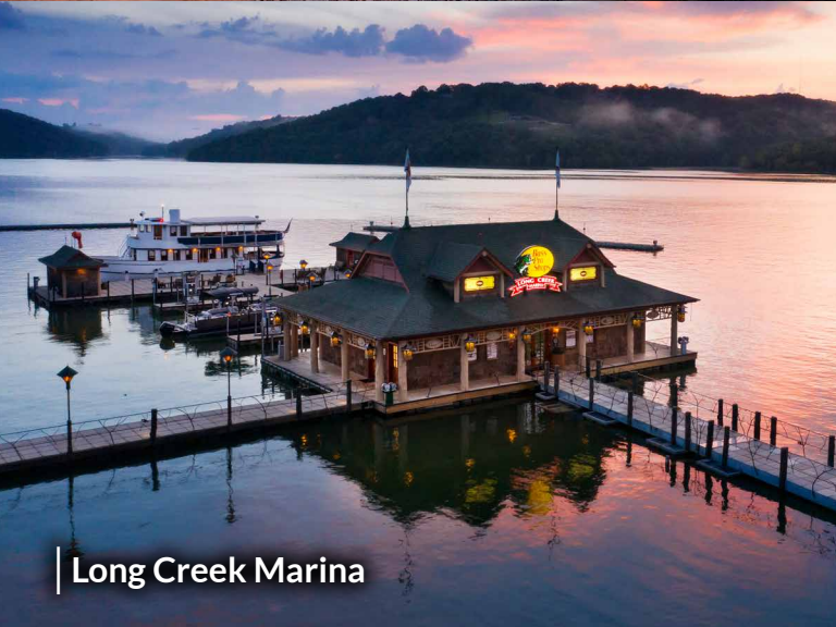
Long Creek Marina