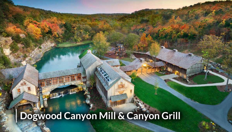
Dogwood Canyon Mill & Canyon Grill