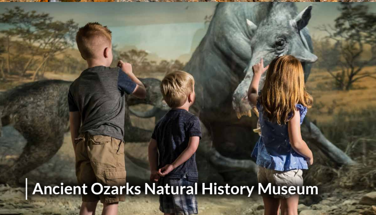
Ancient Ozarks Natural History Museum