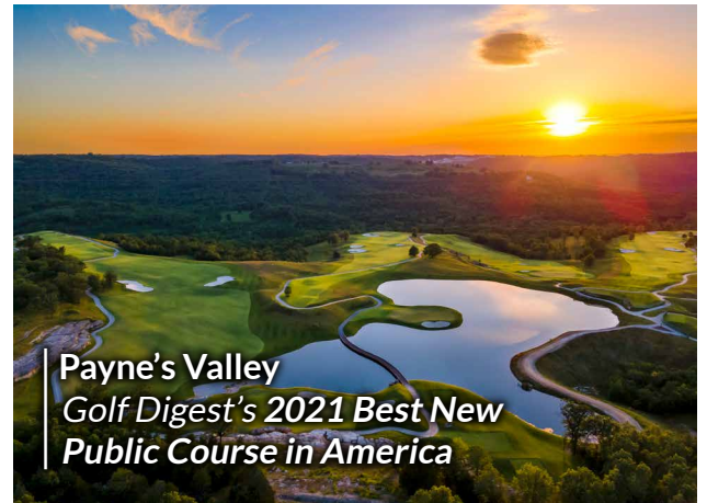
Payne's Valley Golf Digest's 2021 Best New Public Course in America