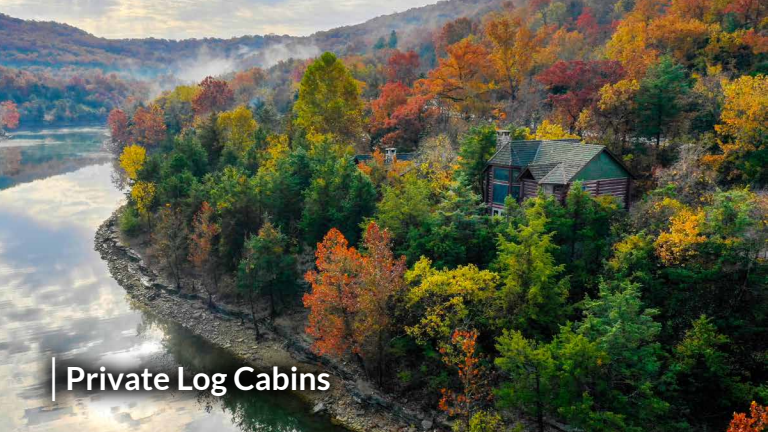
Private Log Cabins