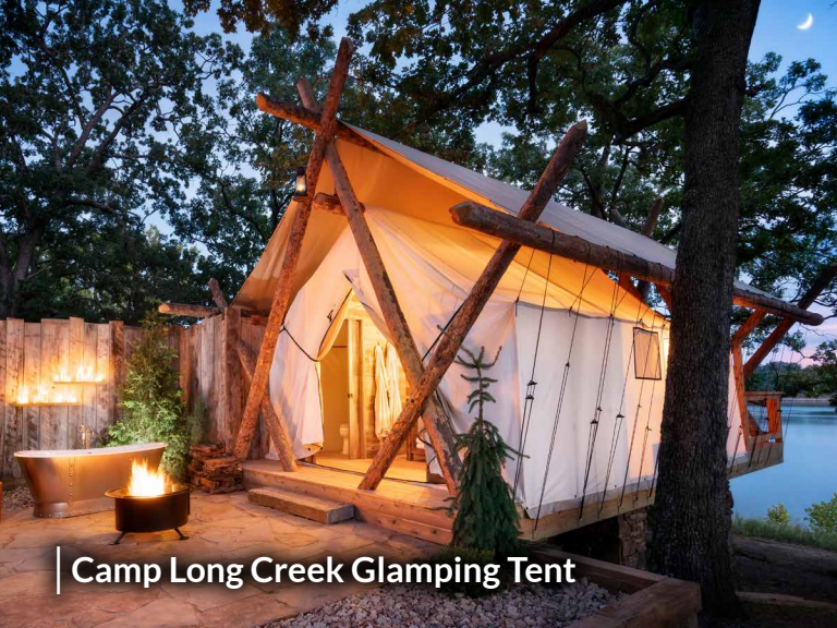
Camp Long Creek Glamping Tent