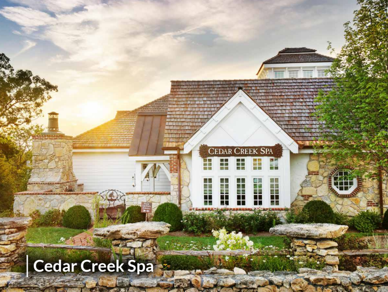
Cedar Creek Spa