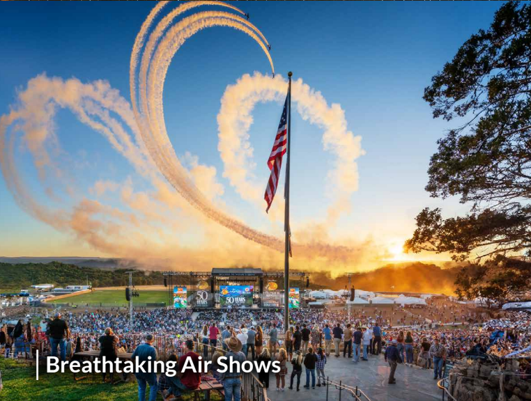
Breathtaking Air Shows