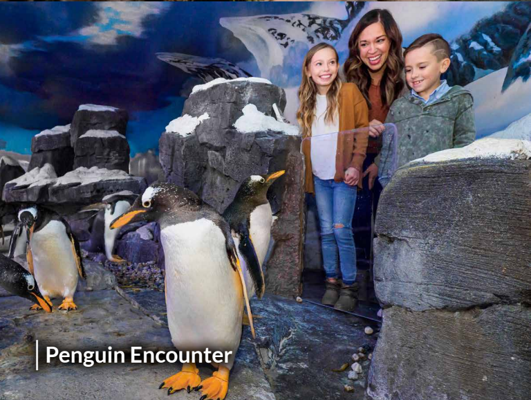
| Penguin Encounter