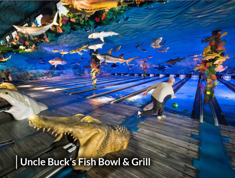
Uncle Buck's Fish Bowl & Grill