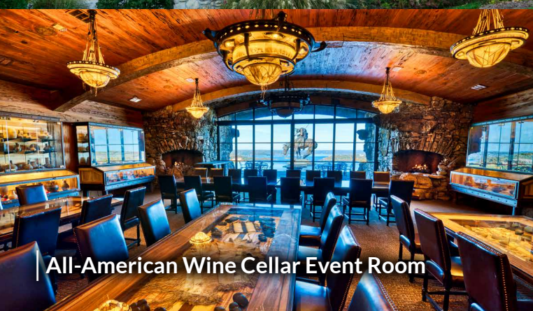
All-American Wine Cellar Event Room