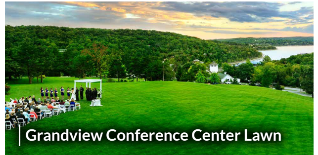
Grandview Conference Center Lawn