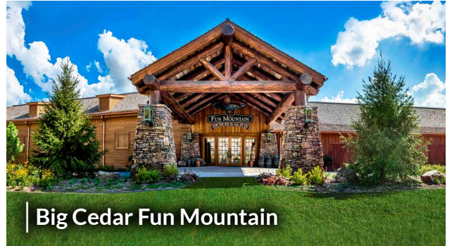
Big Cedar Fun Mountain

This 50,000-square-foot amusement complex features family-friendly dining and entertainment including Uncle Buck's Fish Bowl & Grill, an underwater-themed bowling alley and restaurant. Other activities include a state-of-the-art arcade, 4-story open-air Timber Ridge Ropes Course, NASCAR-themed Thunder Alley Go-Carts, laser tag, spin zone bumper cars, climbing wall, golf simulator, and billiards. Fun Mountain is the perfect destination for year-round fun for all ages.